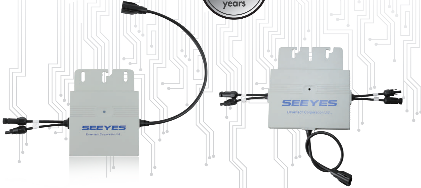
Microinverter Model EVT248